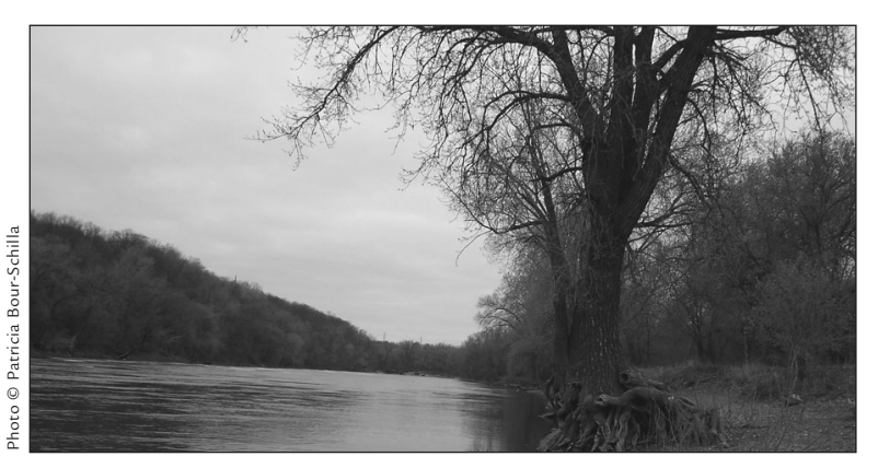
Mississippi River bank and tree