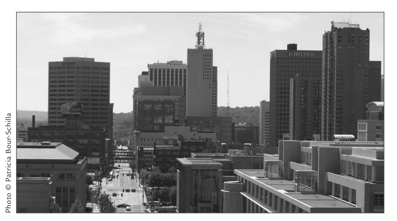
Downtown with First Bank in the distance