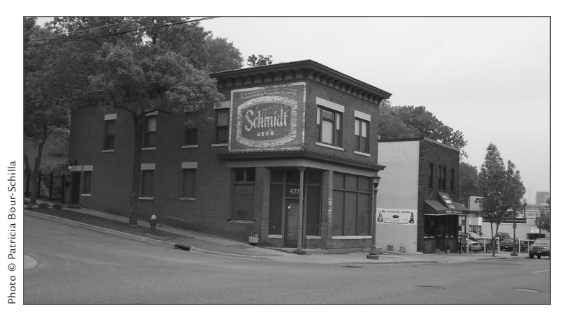
Schmidt beer sign on the West Side