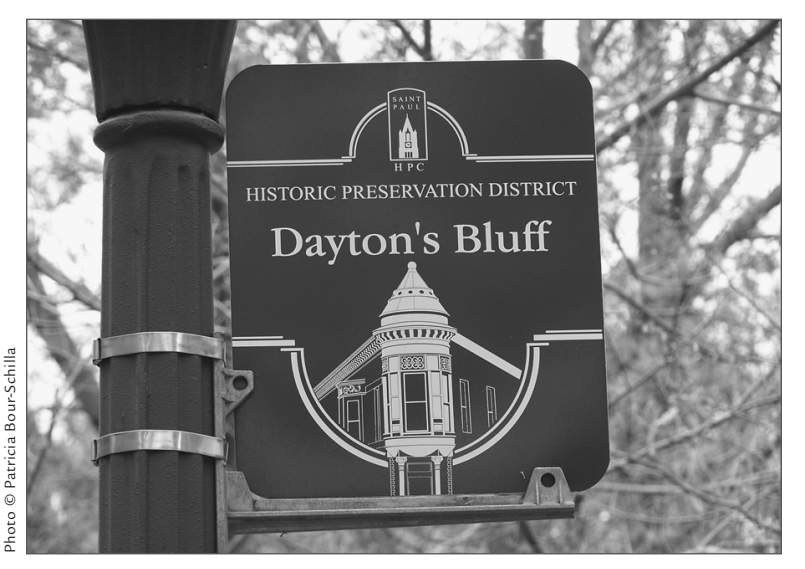
Dayton's Bluff: Full of historic homes

houses, or builders will come in and tear them down. They'll build houses like those in the suburbs."